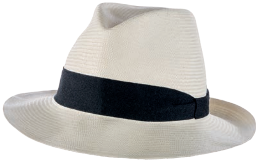
10282317 CARTA TOYO