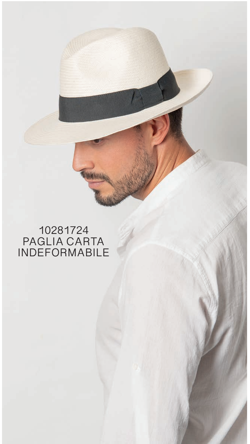
10281724 PAGLIA CARTA INDEFORMABILE